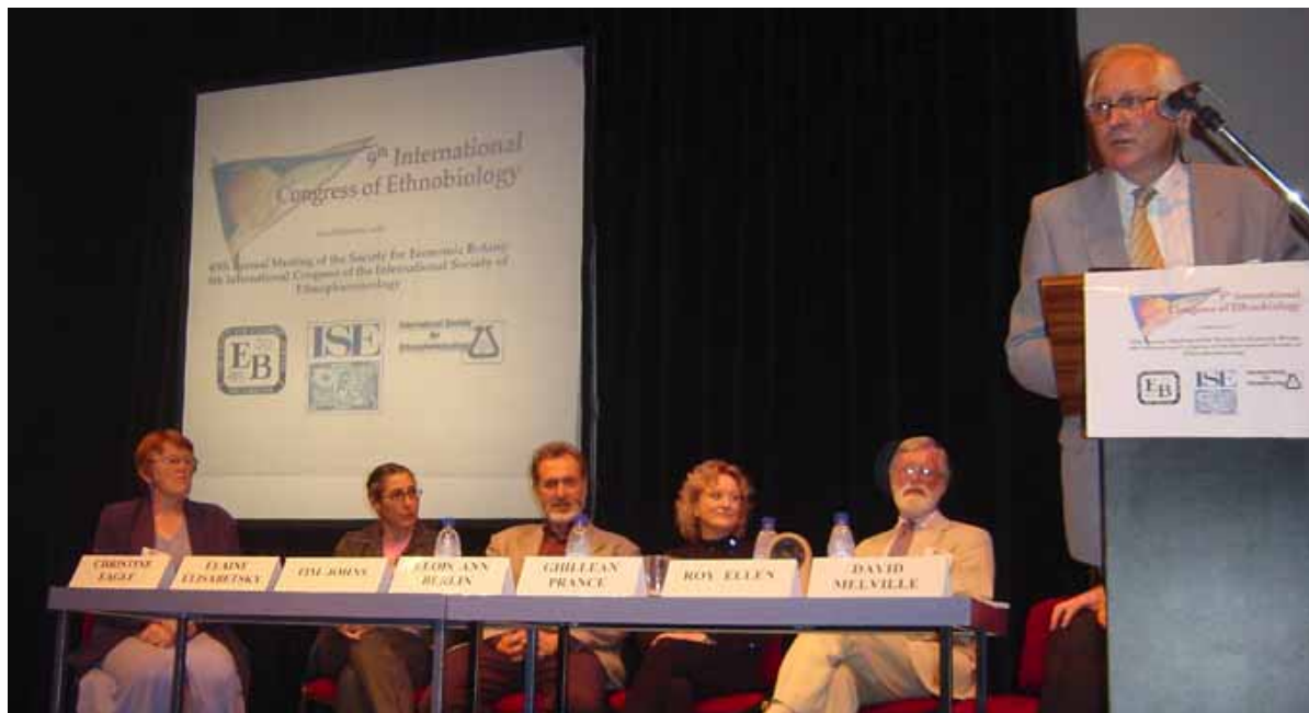
Some of the prominent figures from the organizing societies and representatives of the indefatigable organizers during the opening ceremony of the congress. (Text by the editor)

closer to ethnobiology approaches -- which is inextricably linked to why ethnopharmacology has to be so different than natural products pharmacology, opportunities to foster our understanding of the paramount socio-economic issues that permeate these disciplines and affect every bit of our work. Participants had the chance to merge and listen to each other, to participate in sessions they usually would not, to sit at tables and benches with colleagues they never met before. Never so many prominent figures of these disciplines were present at the same time in one single event, which was quickly noticed by graduate students who made the most out of it.